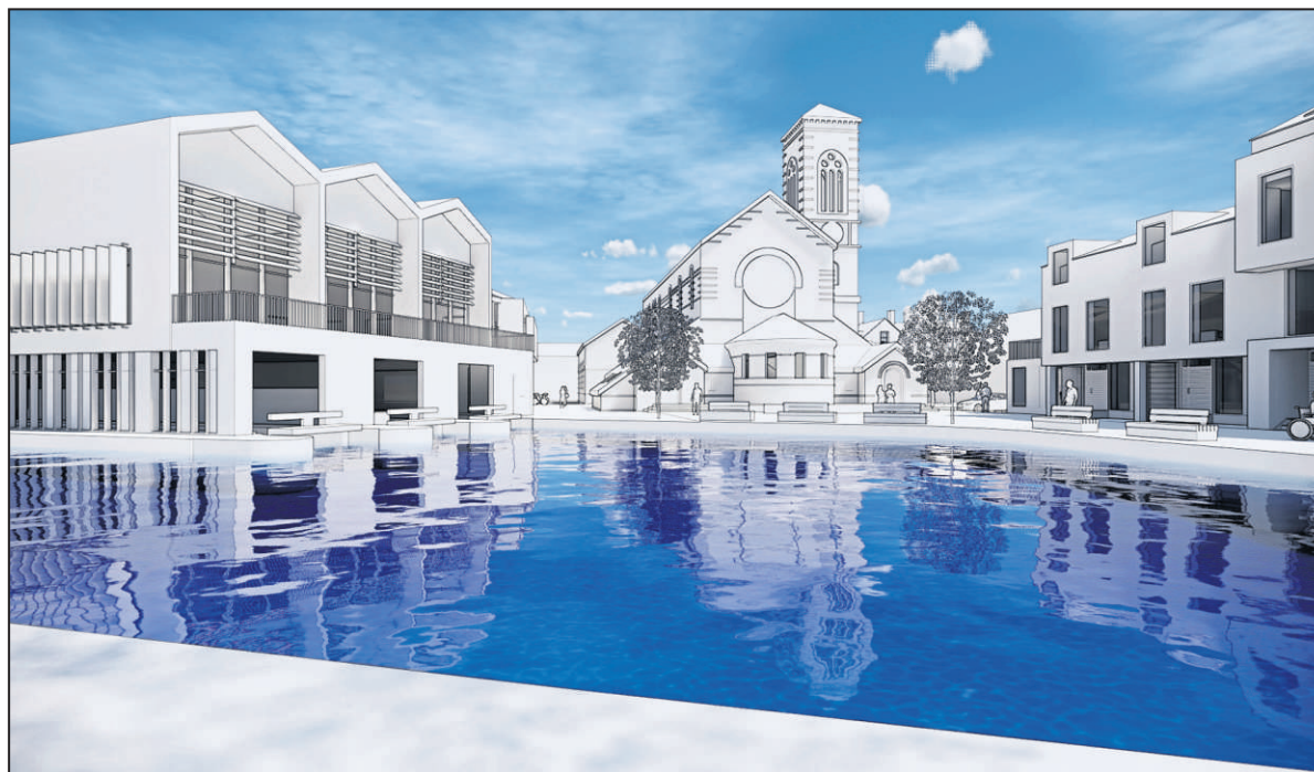
Jericho boatyard piazz.