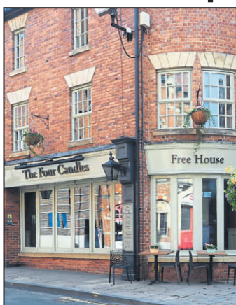
The Four Candles pub in George Street

THE owner of eight Oxfordshire pubs has made a price pledge amid, what it says, is a rise in stealth taxes.